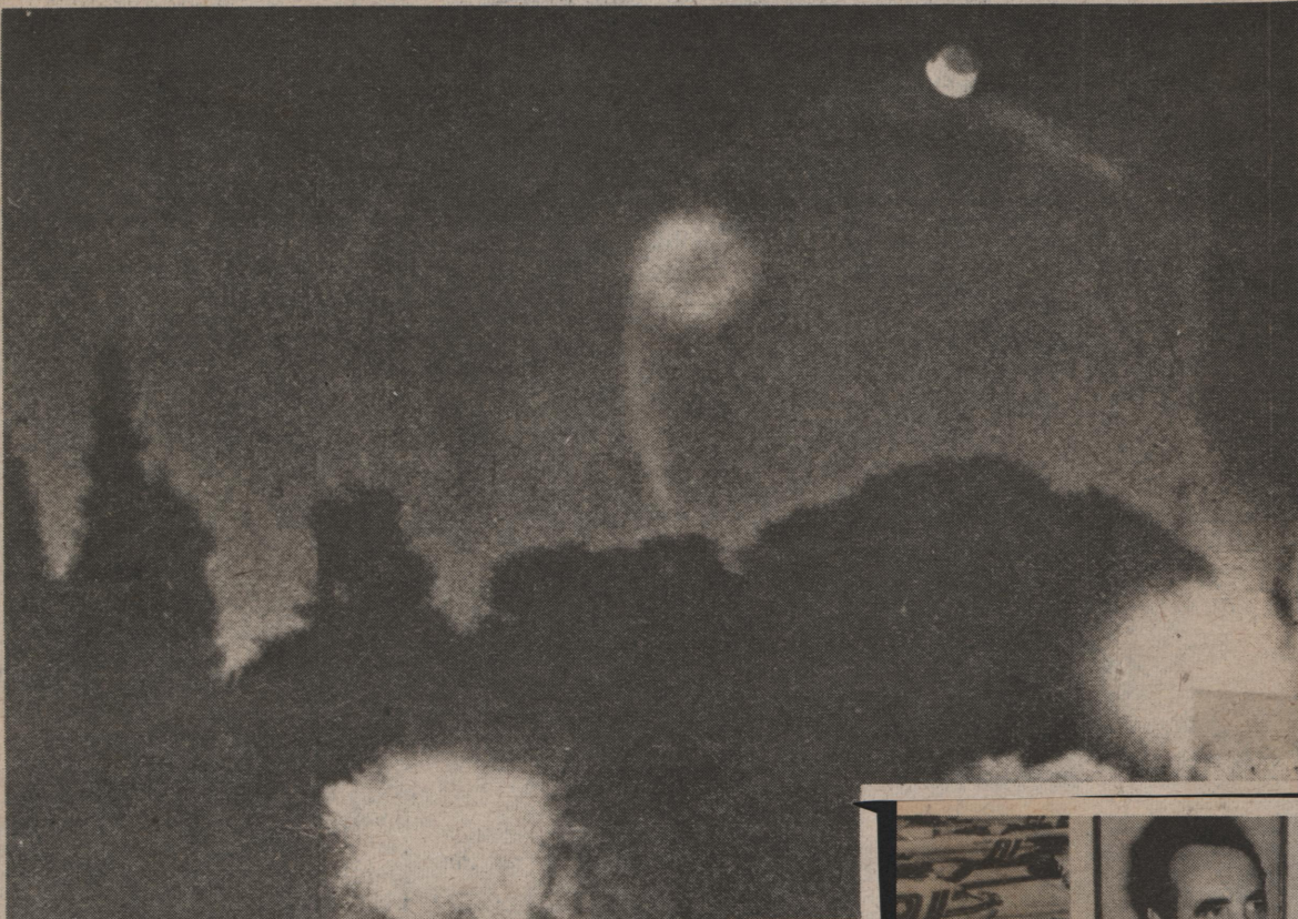
The mysterious UFO appears as a round, luminous cloud to the left of the moon, as it hovers above a park in Rosario, Argentina.